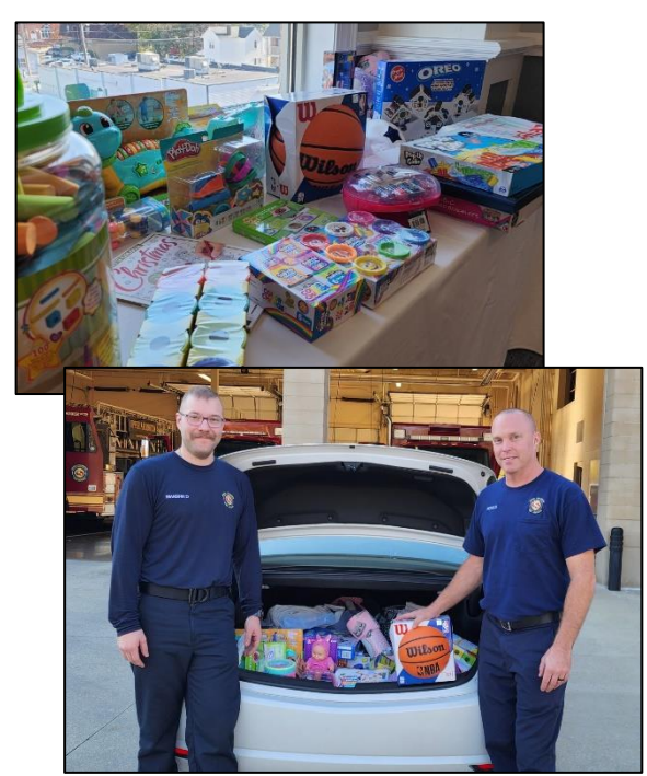
Community Affairs 2023 "Toys 4 Kids" Toy Drive