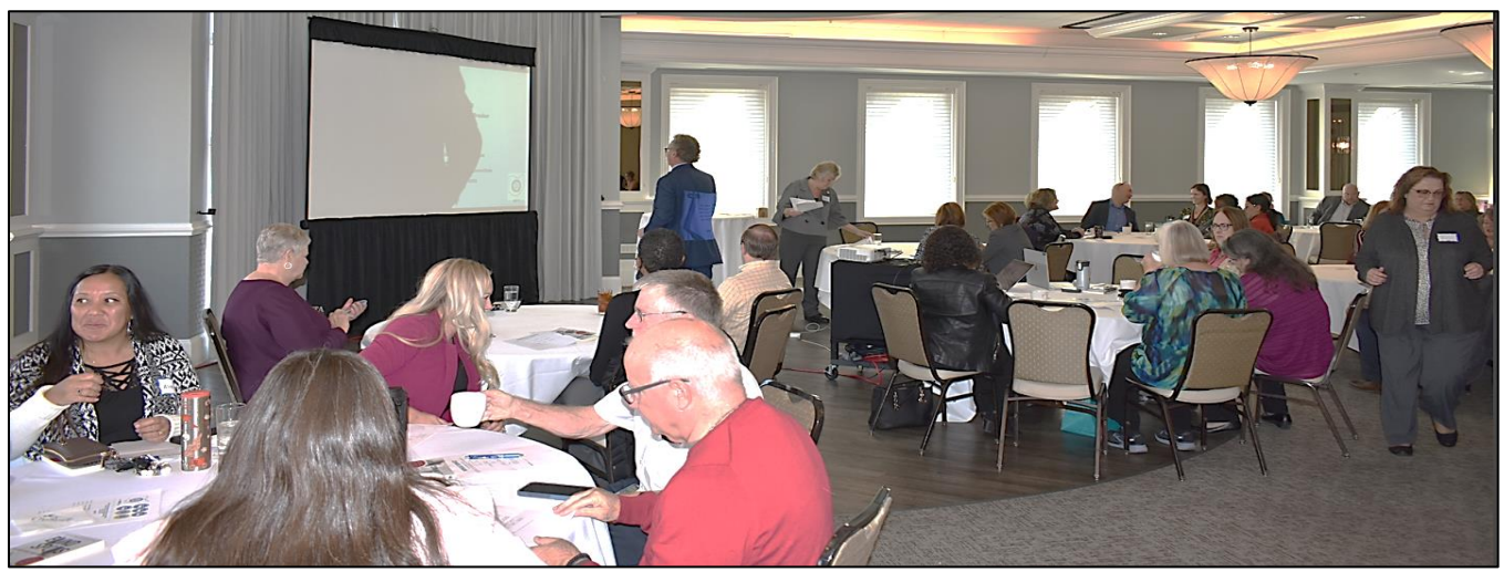
Presentation: behavioral tendency, thinking patterns, motivation, and individual's emotional intelligence.